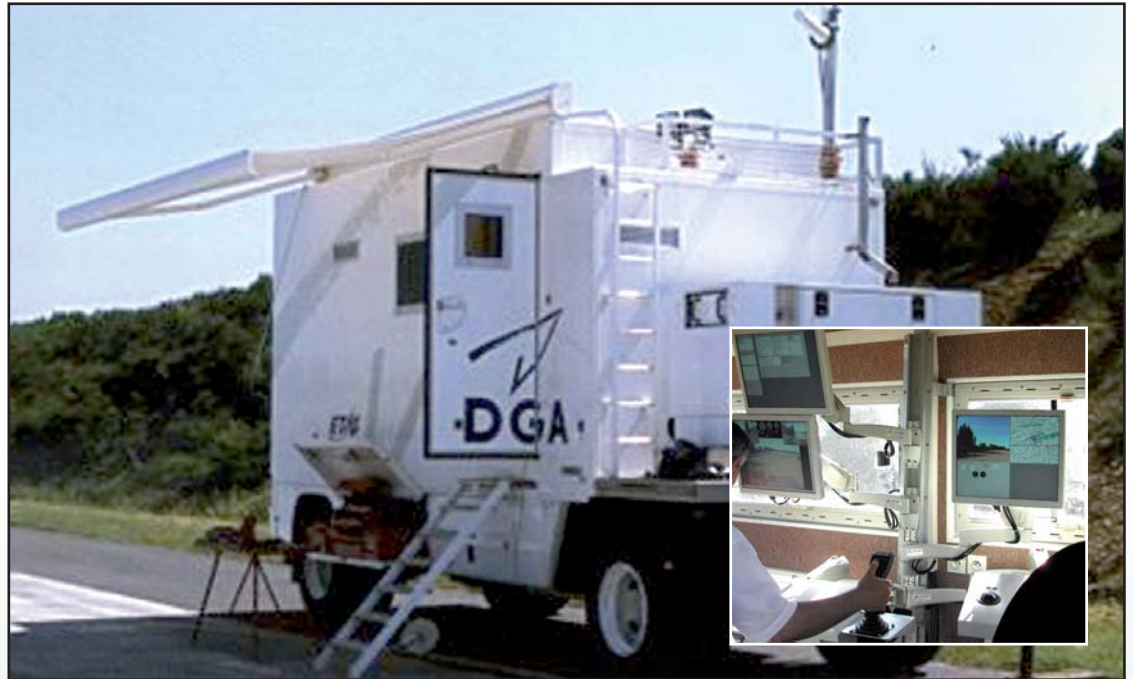
Trailer laboratory for C 2 system

The remote control operation kit of modular design is adaptable to any mobile platform and can be reconfigured in-situ onboard.