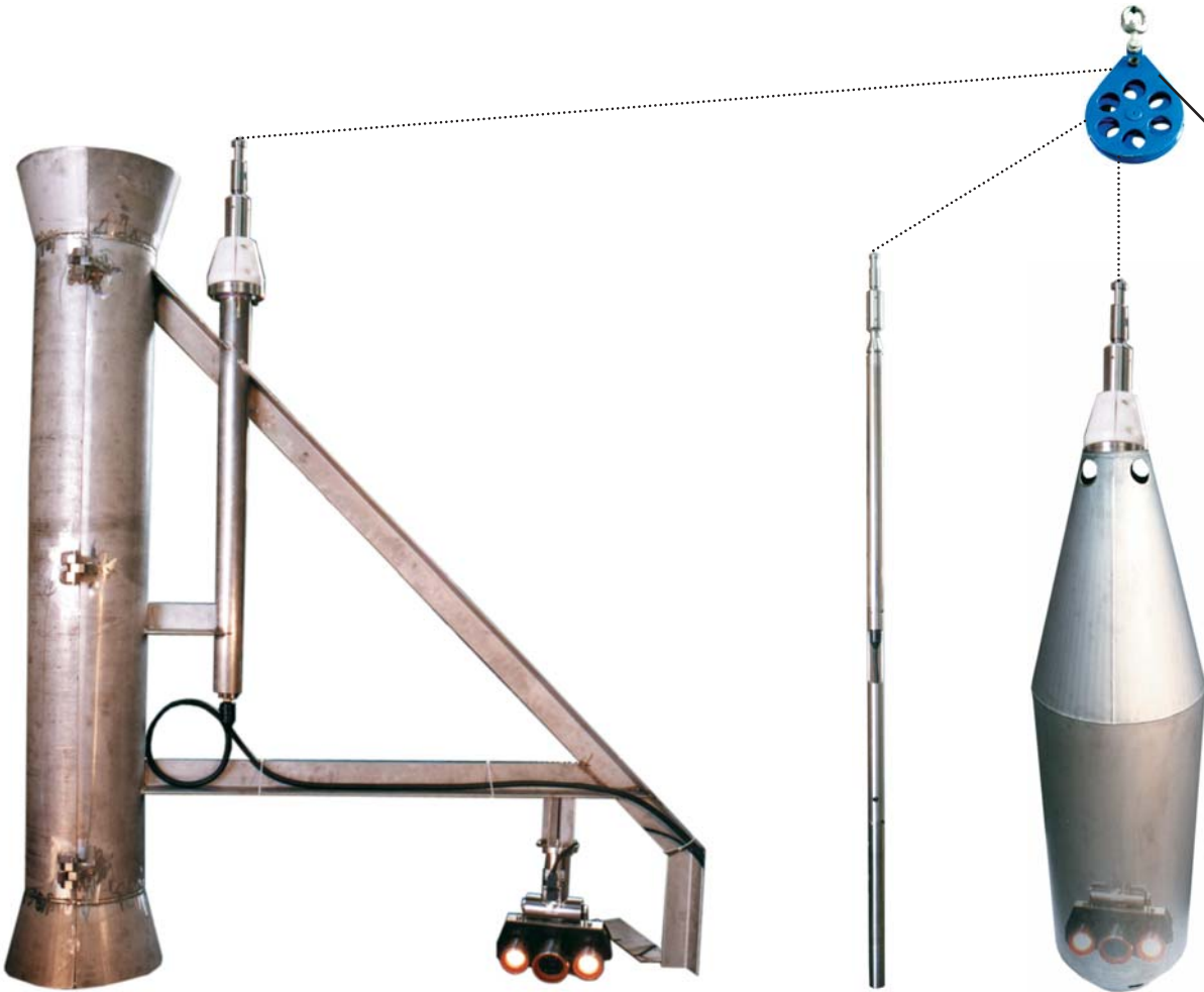
Image sensor : 1/2" CCD 440 000 pixels Resolution : 550 TV lines Sensitivity : 0.1 lux at F 1.2 Power requirement : 12 Vdc Built in lighting : 2 x 12 V / 35 W Lens : 6 mm Angle of view in water : 55°(diagonal) Focus : remotely controlled

Dimensions : Length : 28.7" (730 mm) Diameter : 2.4" (60 mm) Operating depth : 10 000 ft (3000 m) Weight : in air : 15.5 lb (7kg) in water : 11 lb (5 kg) Operating temperature : -10°C to 60°C Construction : stainless steel