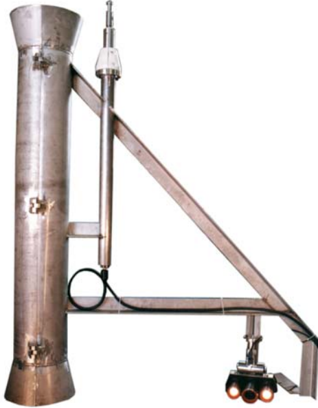
Drillstring running tool